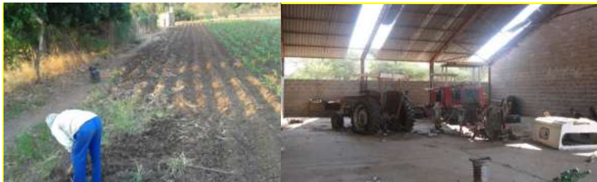
Figure 3. Farmer using a hoe to prepare land for planting while tractors were packed in a shade at Tsvovani.

were left by the Agricultural rural Development Authority (ARDA) were all broken down with some reduced to pieces allegedly because farmers once attempted to build one tractor by cannibalising other tractors (Figure 3). This left farmers dependent on cattle draft power which was inadequate as forty percent of the farmers in the irrigation scheme had no cattle. Farmers owning small hectares in Mutorahuku, Dendere, Vimbanayi and Zuvarabuda prepared land manually using a hoe since they had no draught power and the plots were only 0.1 hectare in size. This is highlighted in Figure 3.